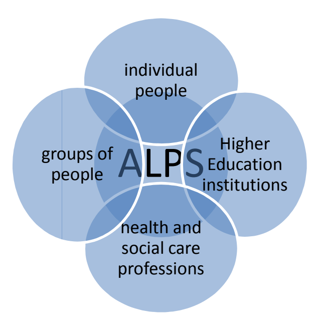
Figure 2 'We got further than we would have done on our own'

their profession across several HEIs, as well as bringing their own personal skills and beliefs.